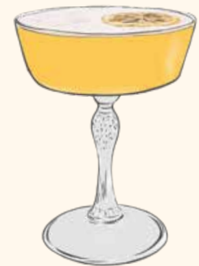
Pineapple Chilli Daiquiri

Davidson plum gin, apricot brandy and lemon.