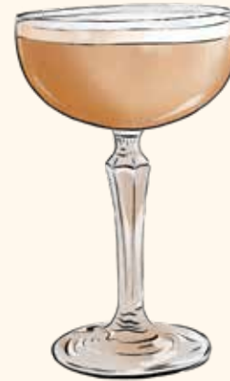
Pretty Boy Floyd Daiquiri Ron Zacappa XO, lime and sugar.