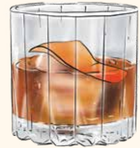
Al Capone Old Fashioned Rip Van Winkle, bitters and sugar.