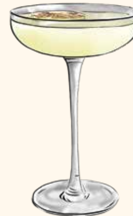
Baby Face Nelson Margarita Clase Azule Reposado Tequila, lime and agave.