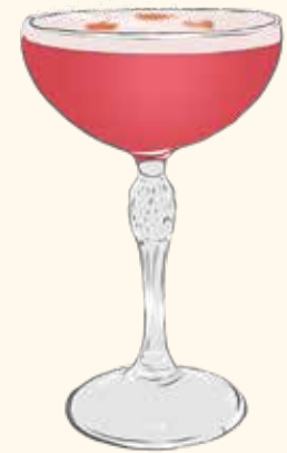
Plum Club Sour

Tropical gin, Midori, passionfruit, orange, lime and aquafaba.